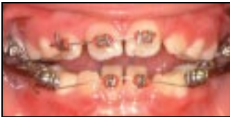
156 Herbst Variations